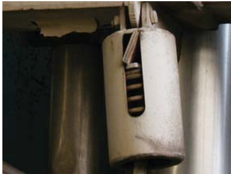
Figure 3: C-Type Variable Spring Can during operation with upper travel stop still in place.