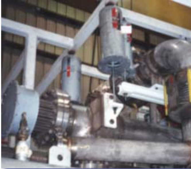
Figure 4: Variable Spring Hangers in new installation.

The following procedures should be followed when installing spring cans. These can be used for either Variable Load supports or Constant Load Hangers which are supported from the top. Bottom supported constants are discussed below.