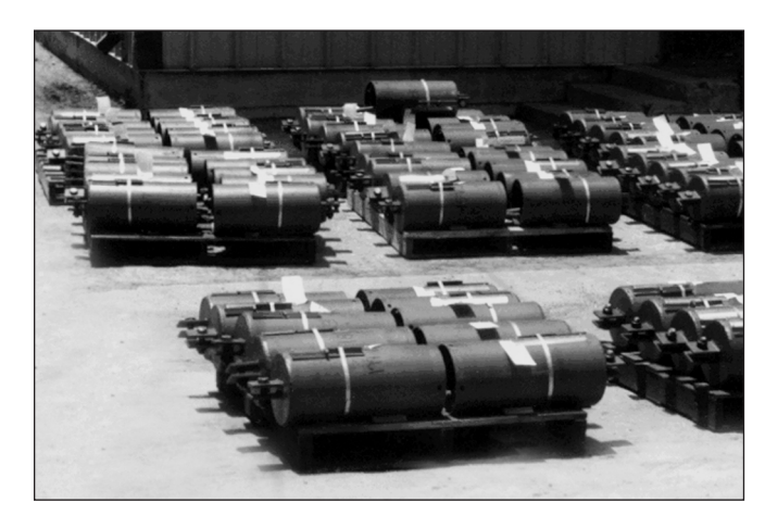
FIG. 400 LIGHT DUTY VARIABLE SPRING HANGERS